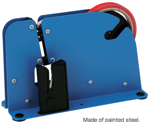
Made of painted steel.