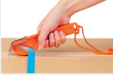
Cut tapes or strings.