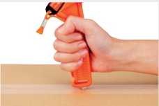
Slit adhesive tapes.