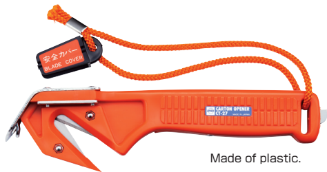
Made of plastic.

Handy cutter for opening of cartons. One set (2 pcs.) of extra blade is stored inside handle.